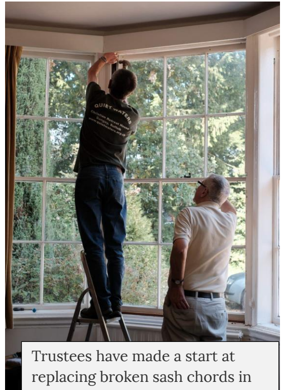
Trustees have made a start at replacing broken sash chords in our beautiful Georgian windows.